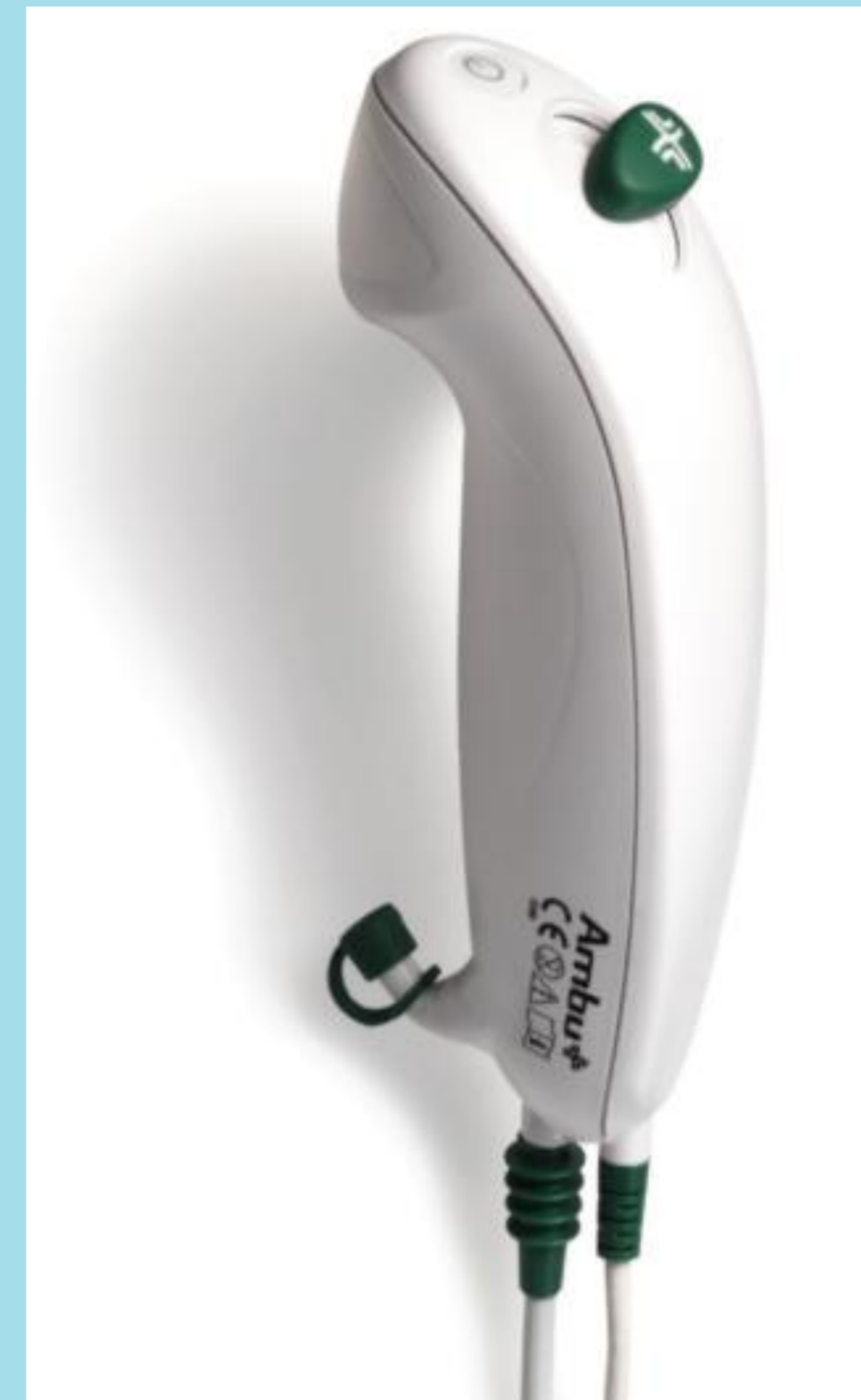
The Ambu aScope